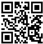
Scan with mobile device.

New York Central Mutual Fire Insurance Company is rated "A+" (Superior) by the A.M. Best Company, analysts of the insurance industry since 1899.